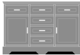
DOBF62S48 48W 18D 32H