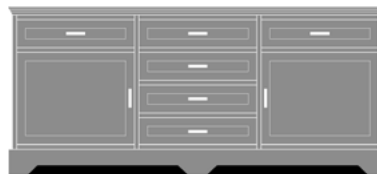
DOBF62S72 72W 18D 32H